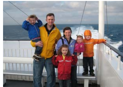
Crossing the Strait of Gibraltar

Merry Christmas and greetings in the name of our Lord Jesus Christ. We pray that God was as gracious to you as he was to us this year. 2008 was a great adventure for the Hanly family. We packed up our house and moved to Dublin, Ireland for 6 months. We traveled intensely—visiting 13 countries—and even celebrated St. Patrick’s Day on the Emerald Isle (NOT what you would expect—ask us about it sometime). We returned home at the end of May.