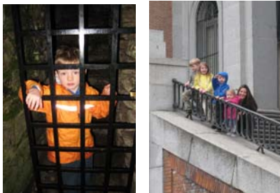
Blarney Dungeon Prado Madrid