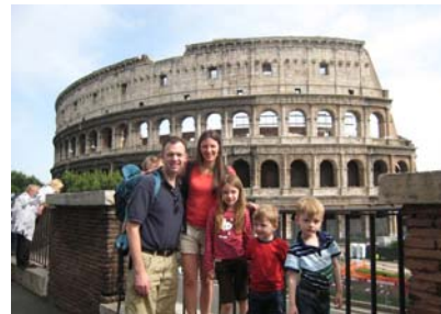
The Coliseum in Rome, Italy