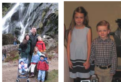
Powerscourt Piano Recital