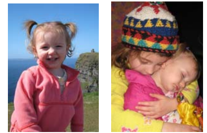
Cliffs of Moher Asleep on Ferry