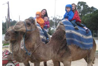
Riding camels in Morocco

Electronic version available at: www.christiansurgeon.com