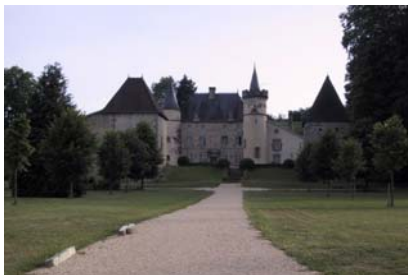
Château de Lichécourt, 6 th Anniv.