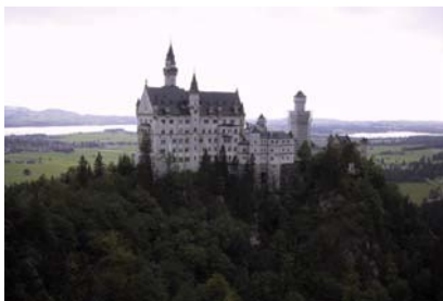
Neuschwanstein Castle, Austria