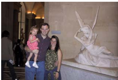
"Love & Psyche," Canova, Lourve